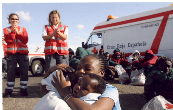
SPAIN, A mother reunited with her children after arriving on the Island of Fuerteventura, Canary islands, 2006.

At the 31st International Conference of the Red Cross and Red Crescent the Movement (5) in 2011, States agreed to work towards enhanced cooperation between public authorities at all levels and National Red Cross and Red Crescent Societies in order to promote respect for diversity, non-violence and social inclusion of all