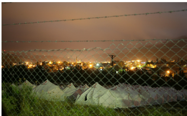
‘TURKEY, Turkish Red Crescent camp set up to welcome Syrians fleeing unrest, June 2011