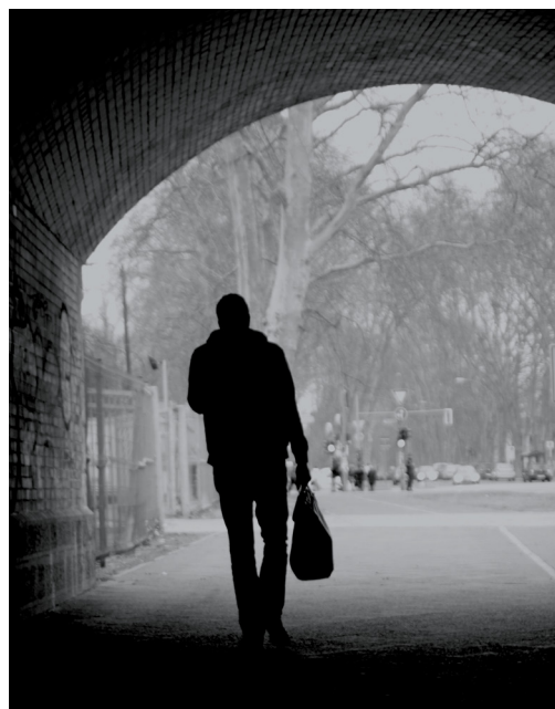
'GERMANY, Life in illegal residency, 2011

Existing migration policies should be reviewed to ensure that they are fair and truly create opportunities for legal and safe migration in dignity, whether for employment purposes or for family reunification.