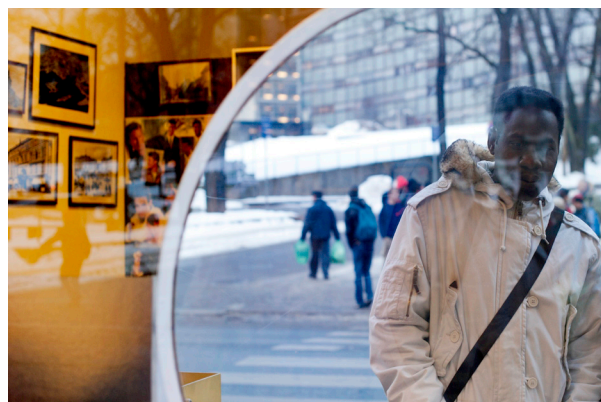
‘NORWAY, Health center for irregular migrants in Oslo, 2011

“The EU must ensure that migration takes place in safety and with full respect for fundamental rights. A truly open Europe should be based on clear values and principles”