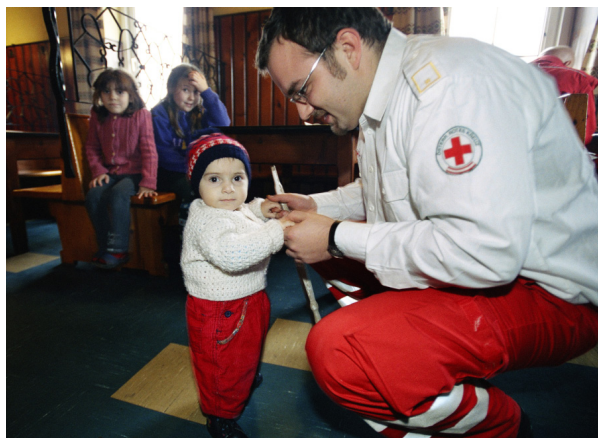
'AUSTRIA, Providing assistance in Red Cross housing for asylum seekers in Steyr

28 National Societies in the European Union and Norway form part of the world's largest humanitarian network, and employ over 250,000 staff. They also engage well over one million volunteers, and have more than eight million members. The Red Cross EU Office represents their interests, as well as those of the International Federation of Red Cross and Red Crescent Societies (IFRC), before the European Union (EU) and its institutions.